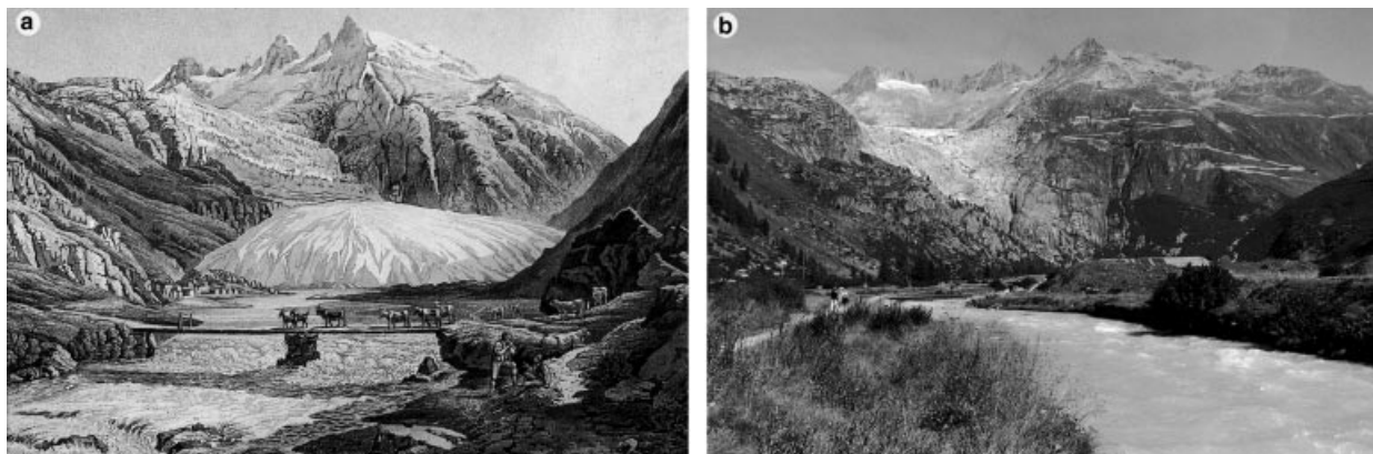
Fig. 2 The Rhone Glacier in 1825 (a) and in 1998 (b), illustrating the dramatic changes during the last two centuries. The glacier has retreated almost to the top of the steep rock face, thereby creating a glacial floodplain with another glacier-fed river, the Mutt, leading to a substantial increase in spatial and temporal habitat diversity.

Glacial area has also varied over historic time scales. The 'Little Ice Age' between about 1550 and 1850, was the latest and most dramatic episode of Neoglaciation. The twentieth century was characterized by a general retreat of glaciers in the European Alps and in northern Europe (Fig. 2). However, the widespread retreat of glaciers in the European Alps seems to have been arrested in the 1960s and subsequently the termini of many glaciers have slowly re-advanced, although overall increases in area have been small (Kasser, 1983). In northern Europe a similar retreat has been documented throughout much of the last century. However, many of the western glaciers in Norway have also begun to advance, some of them dramatically, over the past few years because of increased winter precipitation (Fig. 3, Winkler et al. , 1997). In North America, there has been a general pattern of glacial retreat over the past 50 years, although in Alaska there was an increase in glacial mass in the 1970s (Mayo & March, 1990). However, this increase was not sustained (Melack et al. , 1997).